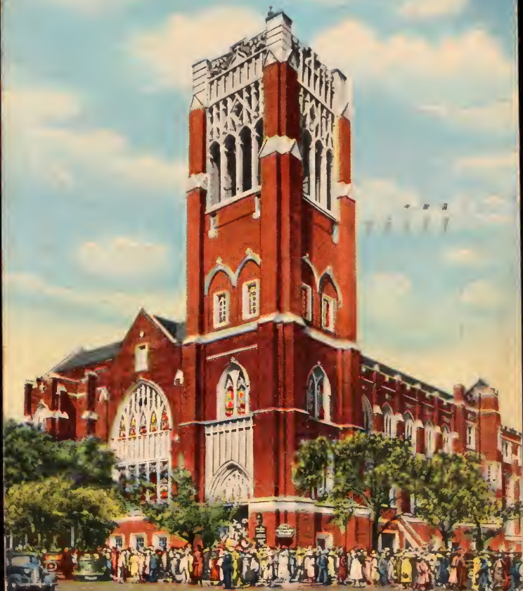
First Methodist Church, St. Petersburg, Florida